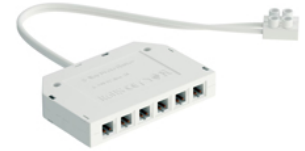
MSC8924V6P-WT 6 Port Hub for Low Voltage Plug Connection