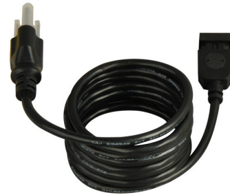
87880 BK, WT MXInterLink4 Connector Cord 72" 72"L x 1"W x 0.5"H