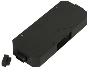
87885 BK, WT MXInterLink4 Direct Wire Box 2.25"L x 5"W x 1"H