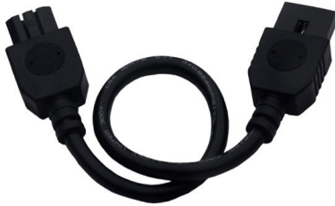
9" 87876 BK, WT 18" 87877 BK, WT 24" 87878 BK, WT MXInterLink4 Connector Cord