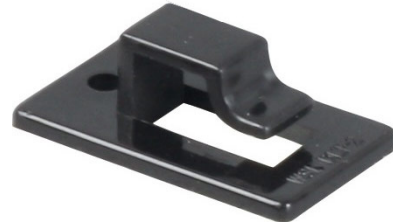
53255 Plastic Wire Clips (Package of 10) 1"L x 0.5"W x 0.25"H