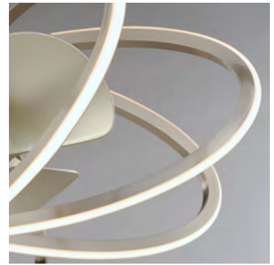
FCT6100WT (Remote Control)