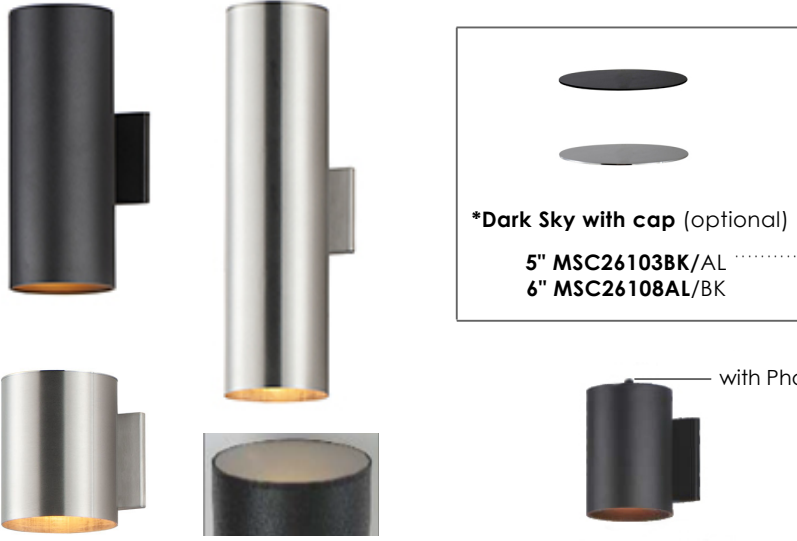
Glass lens on the top

Job Name : _____ Job Type : _____ Quantity : _____ Comments : _____