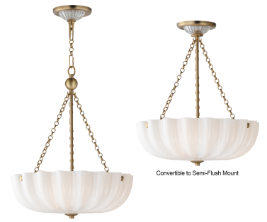
Convertible to Semi-Flush Mount