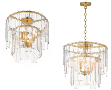
Convertible to Pendant