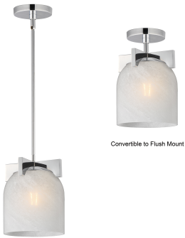
Convertible to Flush Mount