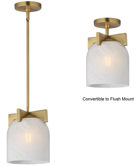
Convertible to Flush Mount