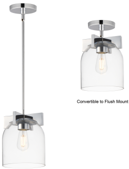
Convertible to Flush Mount