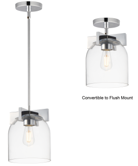
Convertible to Flush Mount