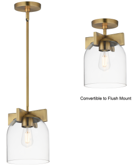
Convertible to Flush Mount