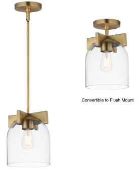
Convertible to Flush Mount