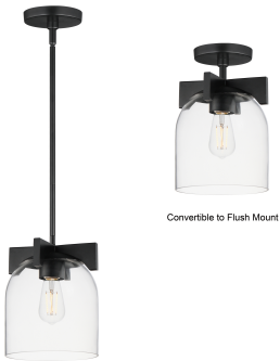
Convertible to Flush Mount