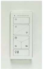
FCT6100WT Wall Control (Included)