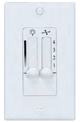
AC Control FCT8881WT