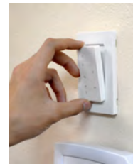
FCT6000WT Wall Control