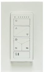
FCT6100WT *Sold Separately