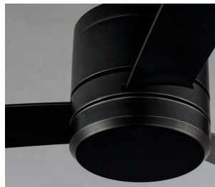
Without Light Kit