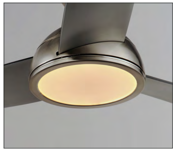
LED integrated dome