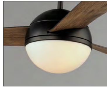
Lamp light kit with domical glass