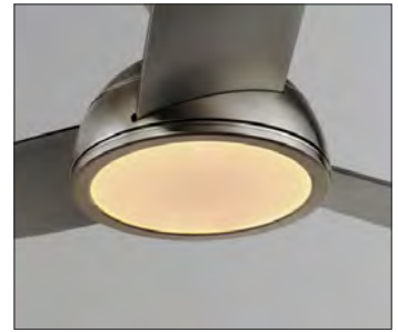
LED integrated dome