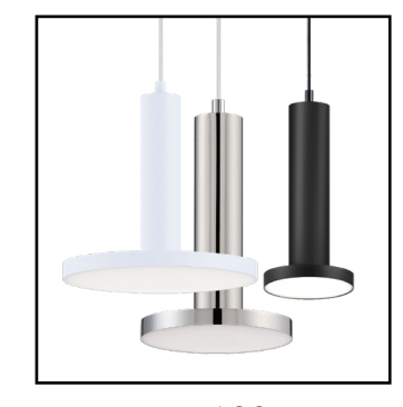
57600 PENDANT ACCESORY (sold separately, fixture not included)

Job Name:_____ Job Type : _____ Quantity : ___ Comments: