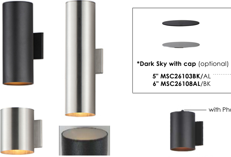
Glass lens on the top

Job Name : _____ Job Type : _____ Quantity : _____ Comments : _____