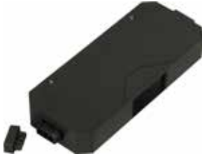
87885 BK, WT MXInterLink4 Direct Wire Box 2.25"L x 5"W x 1"H

Job Name : _____ Job Type : _____ Quantity : _____ Comments : _____