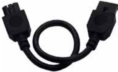
9" 87876 BK, WT 18" 87877 BK, WT 24" 87878 BK, WT MXInterLink4 Connector Cord