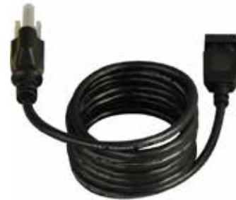
87880 BK, WT MXInterLink4 Connector Cord 72" 72"L x 1"W x 0.5"H