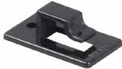
53255 Plastic Wire Clips (Package of 10) 1"L x 0.5"W x 0.25"H