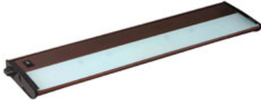
87842MB CounterMax MX-X120c 21" 3-Light 120V Xenon