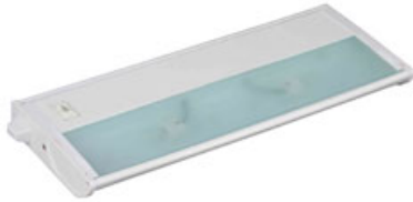
87841WT CounterMax MX-X120c 13" 2-Light 120V Xenon