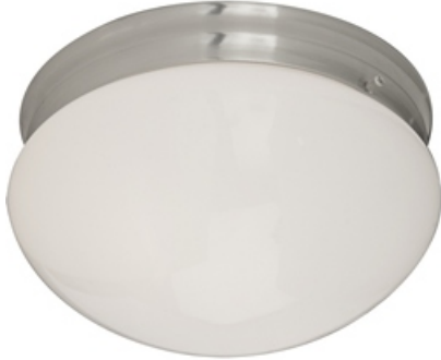
5881WTSN Essentials 2-Light Flush Mount